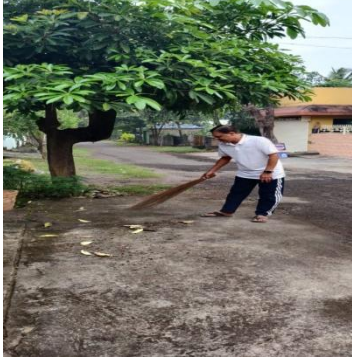
Gandagi Mukta Abhiyan