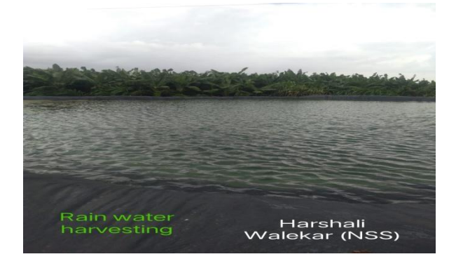
World Water Day