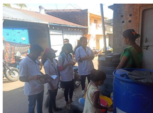
Water borne disease awareness Programme