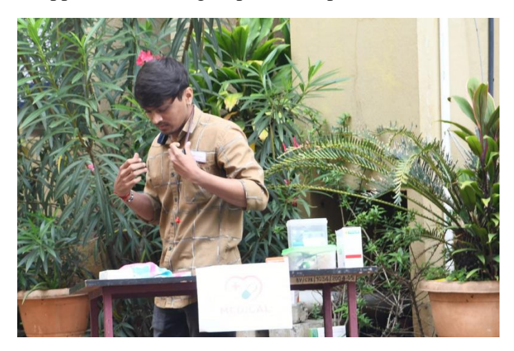
Health Camp and Pathanatya

In the evening all NSS groups presented street plays on health related topics in front of villagers. Village inhabitants also appreciated team group and camp co-ordinator.