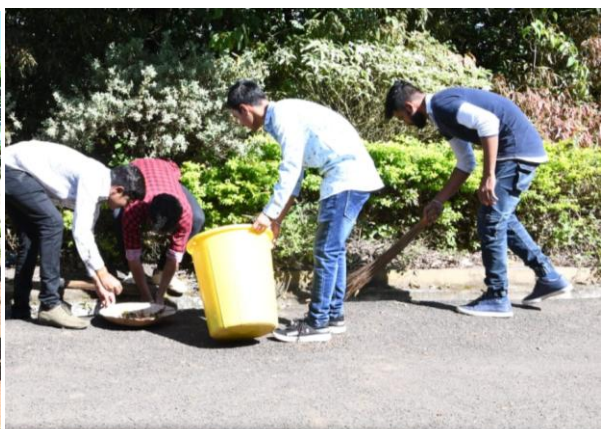
Swachh Bharat Mission Week