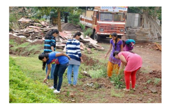
My Earth Campaign- Majhi Vasundhara