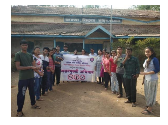
Vyasan mukti Abhiyan

Bharati Vidyapeeth College of Pharmacy under NSS Unit had organized a Special camp at Mouje Sangaon, Taluka -Kagal, District Kolhapur from 28th January 2019 to 3rd February 2019. This programme was organized to create awareness among the people to stay away from the narcotic products as they are responsible for various diseases. So street plays were conducted by NSS students to spread the message and guiding the inhabitants for taking necessary precautions.